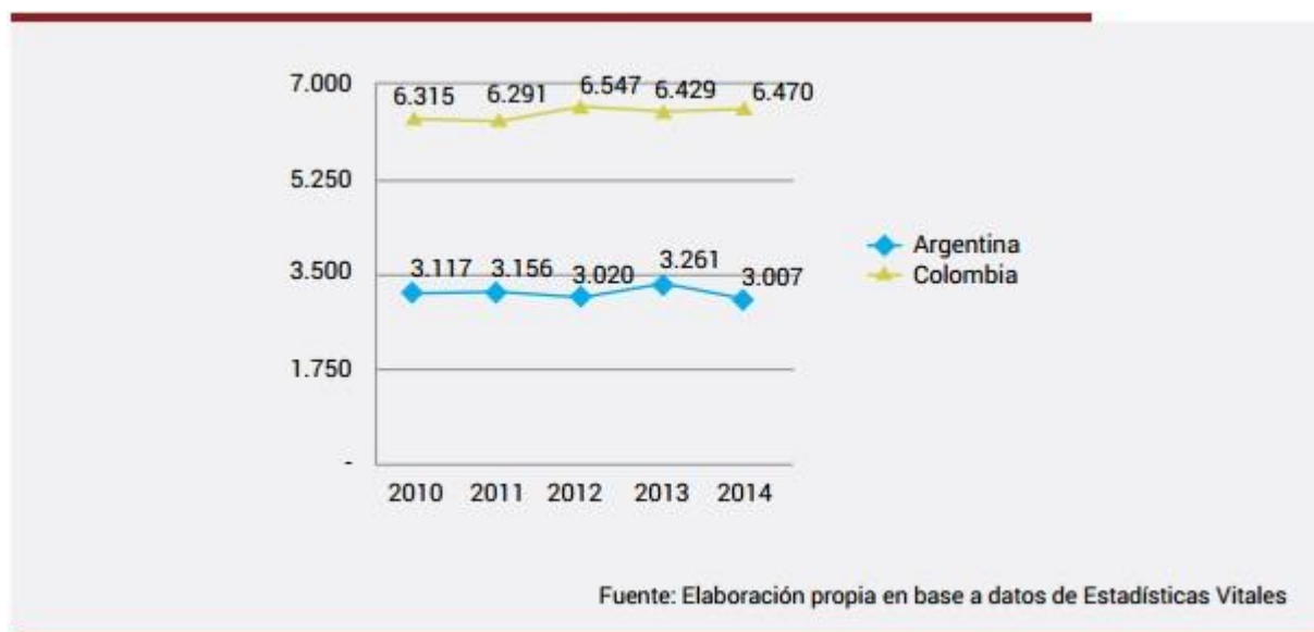
Graph Number 3: Comparison of deliveries by girls under 14 years of age, in Argentina and Colombia